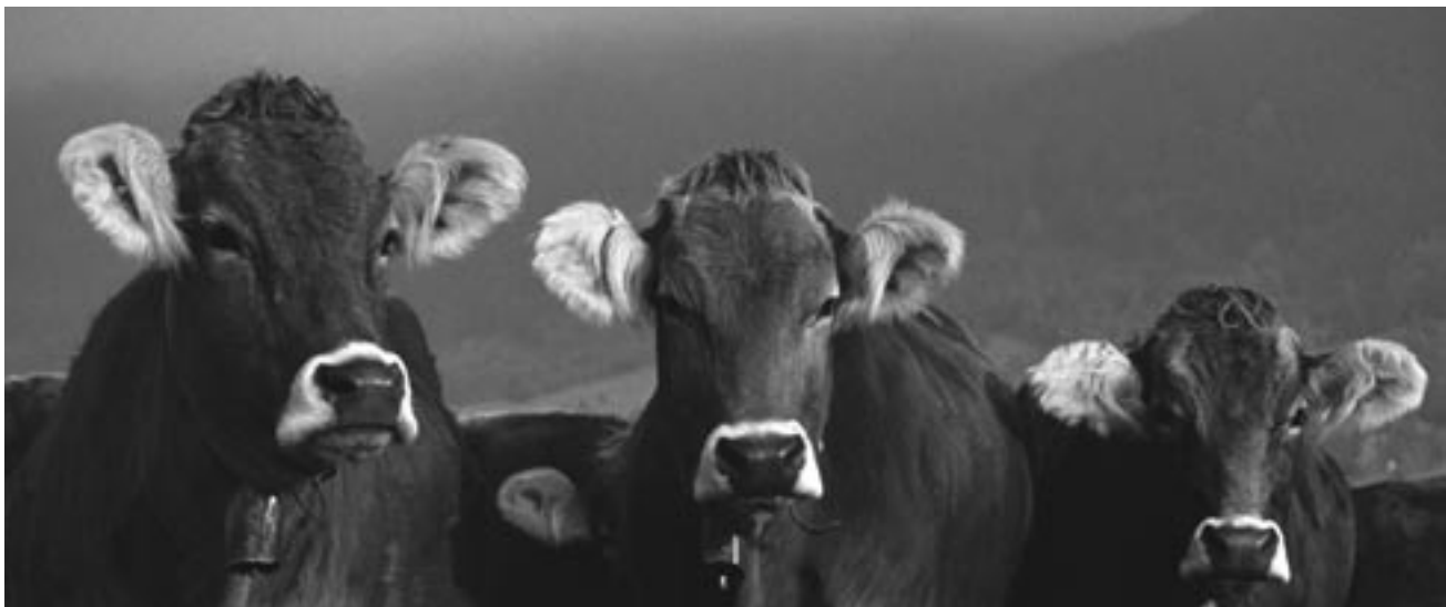
Many organic producers favor colored breeds.

Breeding practices vary within the organic production system. While many dairies use artificial insemination, some use bulls. Some herds use Holsteins. Many organic producers who use managed grazing have adopted grazing genetics, trending toward Jerseys, Normande, Scandinavian Red, Ayrshires, Brown Swiss, and a number of crossbreeds recognized as efficient grazers. These breeds also produce milk with a high fat and protein content, and contribute characteristics like longevity and fertility to their offspring.