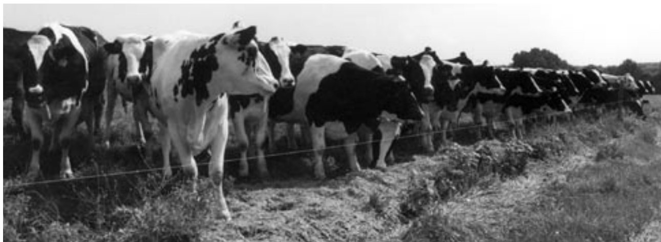
Some grazing operations offer supplemental feed and minerals along fence lines.

Grazed herds are often small; usually, they have fewer than 200 cows. Many have fewer than 100. However, herds can be considerably larger. Productivity varies widely. Management decisions, including adding water to paddocks and supplements to diet, play a significant role in influencing milk output. A seasonally calving farm dependent on grass alone may yield 11,000 to 14,000 pounds of milk per cow per year. Herds that are fed additional grain supplements have higher yields and can achieve 17,000 pounds per cow per year (Johnson, 2005 and UMN-CFFM). When herds are moved from confinement to pasture, a farm may see changes in milk yield, with a production decrease most common. In a survey of dairy herds using the grazing method, 29 percent reported a decrease in production, while 22.5 percent reported an overall increase in production (Kriegl et al., 1999).