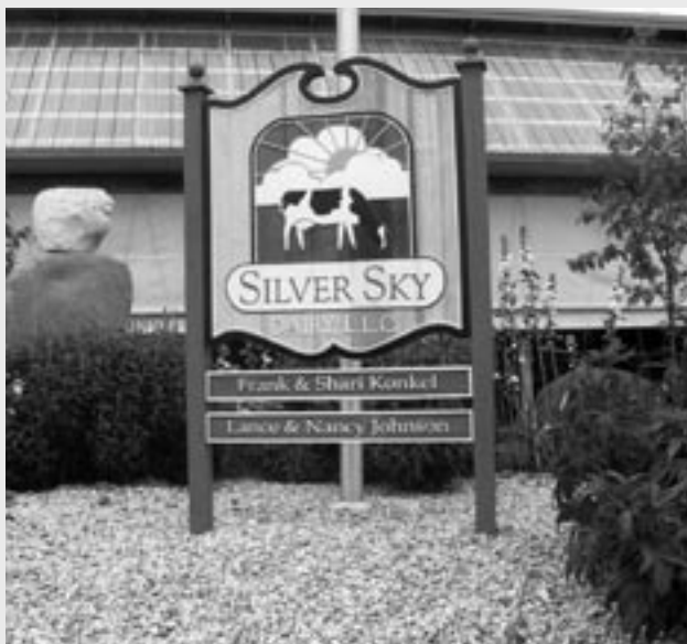
Silver Sky Dairy supports two Michigan farm families.