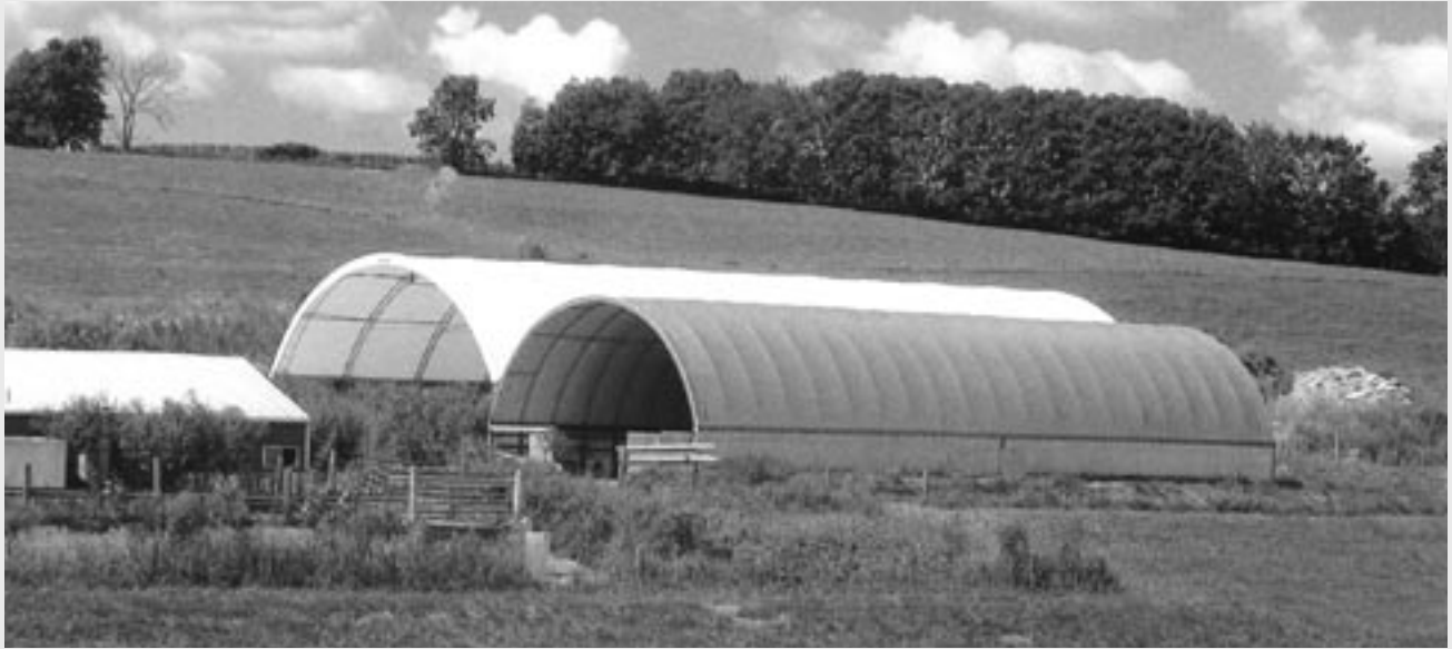
The Vosbergs constructed two canvas hoop sheds to provide shelter on bedded packs during the worst winter weather.

During the design of the pasture and fencing, Dan planned paddock size and shape to fit topography. To avoid erosion, he didn't want to put lanes on steep hills. In the spring, he follows a two-week rotation among his 25 paddocks, sometimes subdividing them with polywire. In the fall, he extends the rotation to 40 days and feeds supplemental hay if needed.