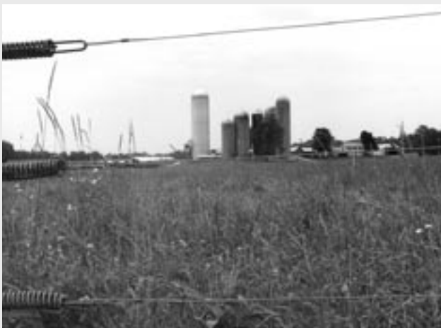
Silver Sky Dairy is a hybrid confinement-grazing operation that uses both pasture and stored feed.