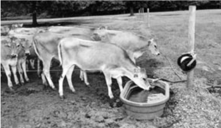
Permanent perimeter fence, portable electric fence, and watering systems are important components of most grazing operations.

Most operations include a moveable system that allows pastures to be subdivided into smaller paddocks as needed. The fences that subdivide the pastures into paddocks use one light wire on a portable spool. They are moveable, have step-in posts, and carry electricity. Farmers may be eligible for state or federal grants to defray the cost of adding fences, lanes, and watering stations. State departments of agriculture, the USDA Natural Resources Conservation Service, and Extension offices can all direct farmers to available assistance and can help producers create grazing plans like the one shown in Figure 1. Each state has laws with specifications for fence requirements along property boundaries.