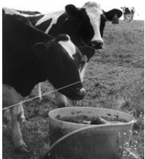
Portable watering systems ensure that cows have access to water, the lowest-cost essential component of a cow's diet.

Water is the lowest-cost essential component of a cow's diet (Dennis Johnson, personal communication, 2005). Watering systems vary from farm to farm. Some graziers position watering stations between paddocks. This method provides cows water in every paddock. Usually, a valve system allows producers to run water from a main line to the paddock that is in use. A float shuts off water when the tanks are full. Many factors, including the topography and elevation of the land, determine the cost of watering systems. A 50- to 100-cow dairy employing a simple system can cost $2,000–$3,000. The cost includes a \frac{3}{4} inch to 1 inch line with valves to shut off various parts of the system, movable tanks, and a couple of float valves (Vance Haugen, personal communication, 2004). Other options include mobile water tanks that can be moved from paddock to paddock along with the cows.